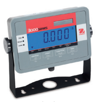
T32MC (LCD version)