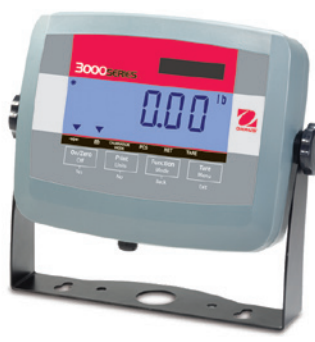
T31P Indicator shown with optional bracket